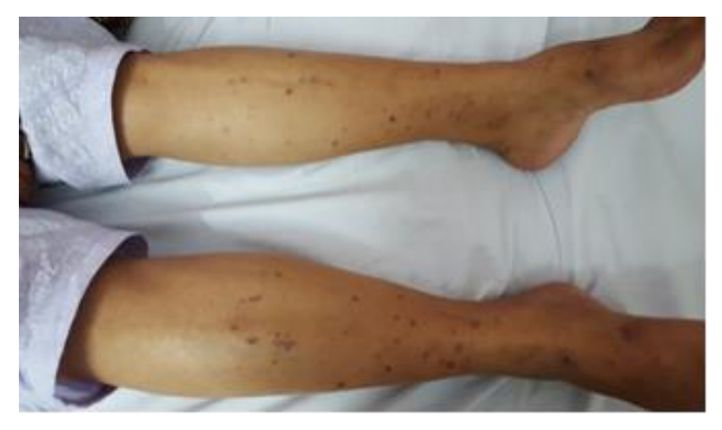
Figure 1: Petechial rash on legs.